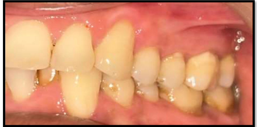
3 MONTHS FOLLOW UP