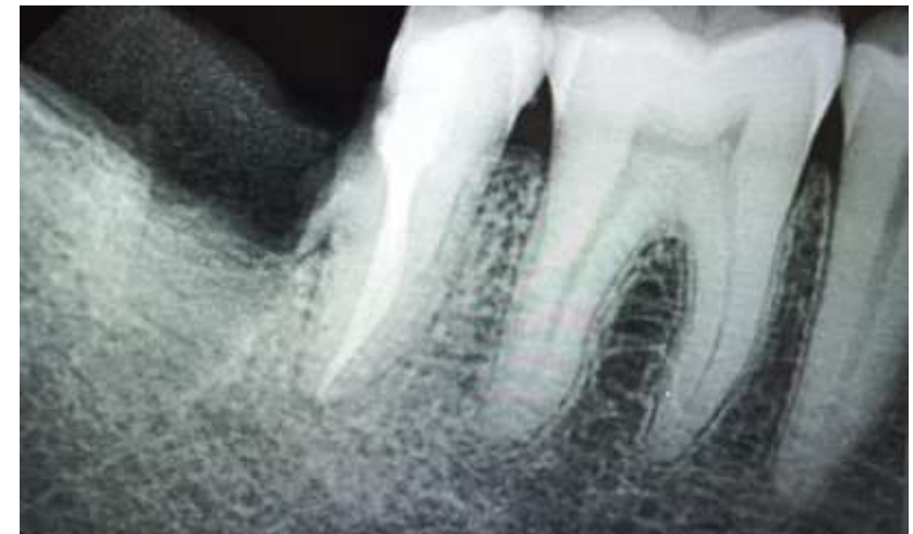
POST OPERATIVE RVG