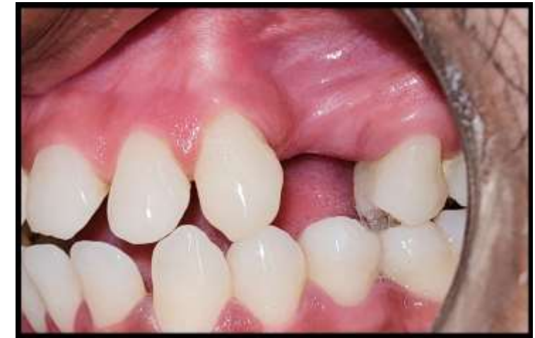
POSTOPERATIVE 3 MONTHS FOLLOW UP