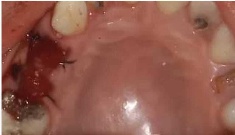
SUTURES PLACED IRT 14,15