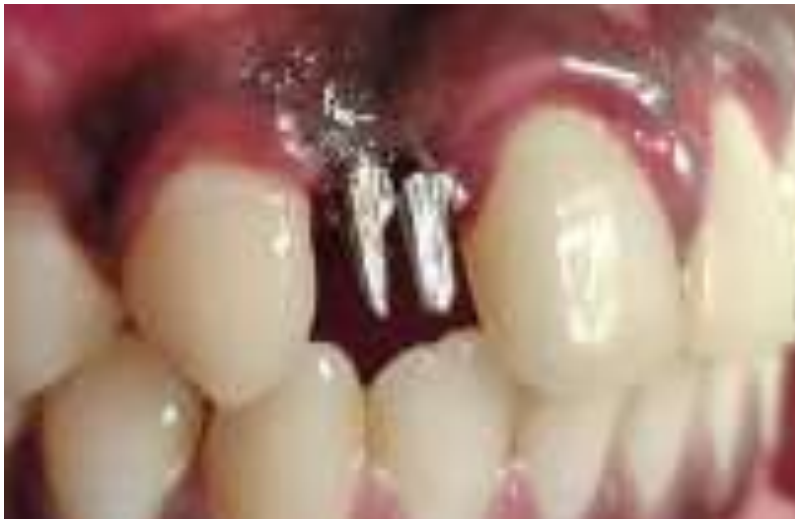
IMPLANTS PLACED IRT 12