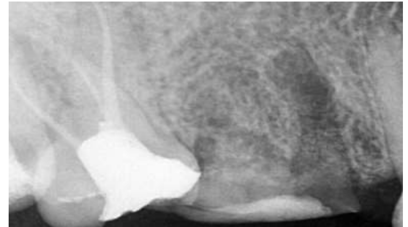
IMMEDIATE POST OPERATIVE RVG IRT 14,15