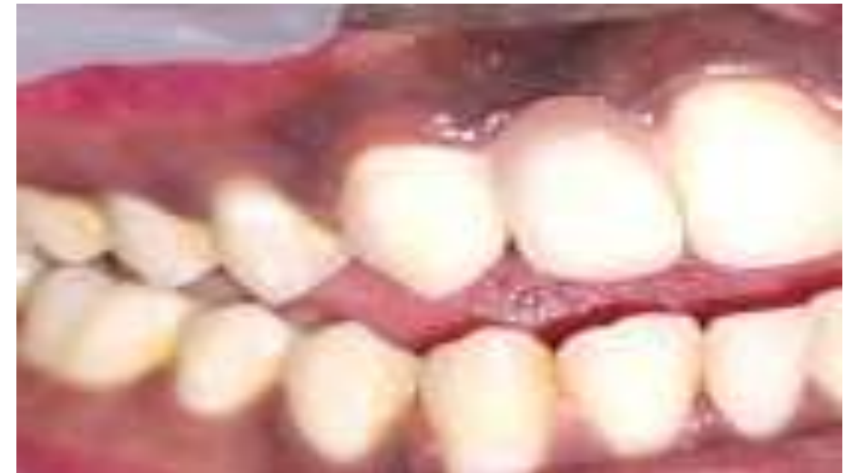
POST OPERATIVE PERMENANT PROSTHESIS GIVEN IRT 12