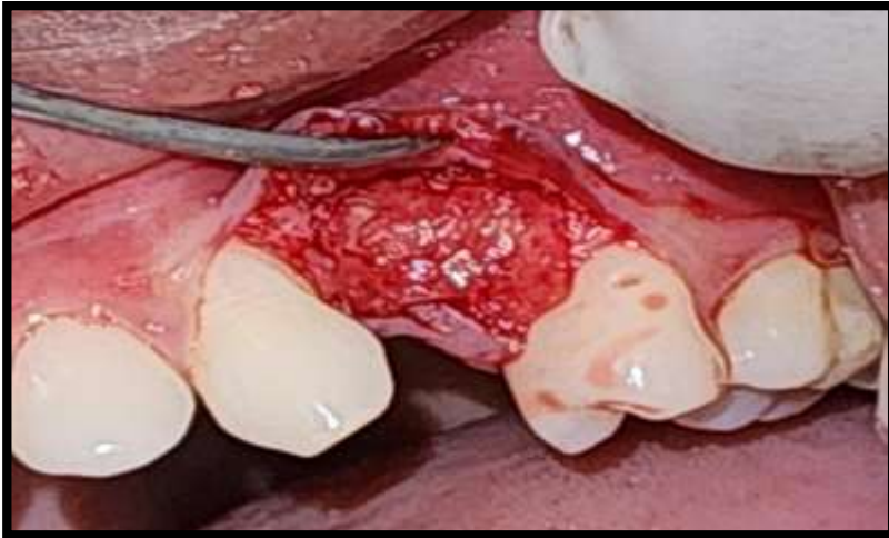
CHORION MEMBRANE PLACED