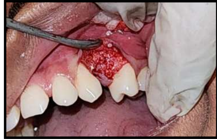
BONE GRAFT PLACED