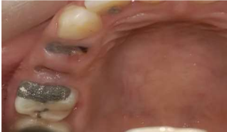
PRE OPERATIVE ROOT STUMP IRT 14,15