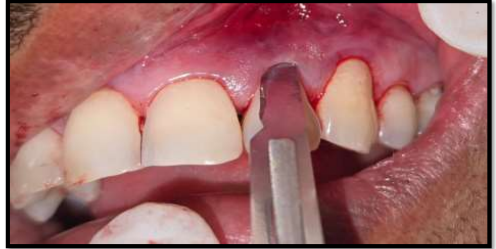
INTRA SULCULAR INCISION