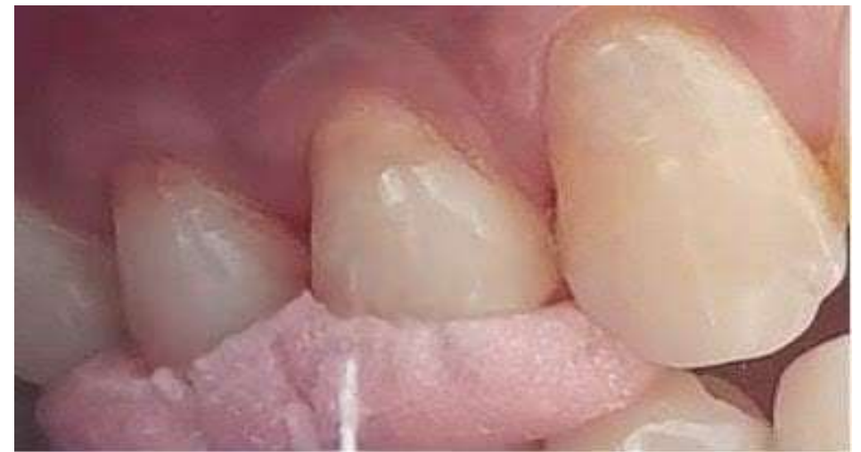
POST-OPERATIVE 3 MONTHS FOLLOW UP