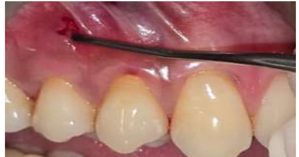
TUNNELING TKN 1 AND 2 KNIFES