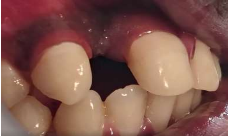
PRE-OPERATIVE VIEW IRT 12