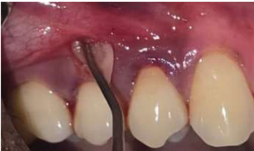
APRF+ MEMBRANE PLACED