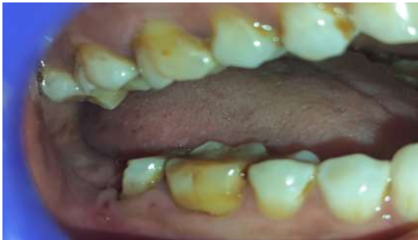
POST OPERATIVE 3 MONTH FOLLOW UP